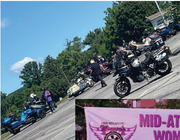
Chip Away tokens encouraged exploration of Adams County